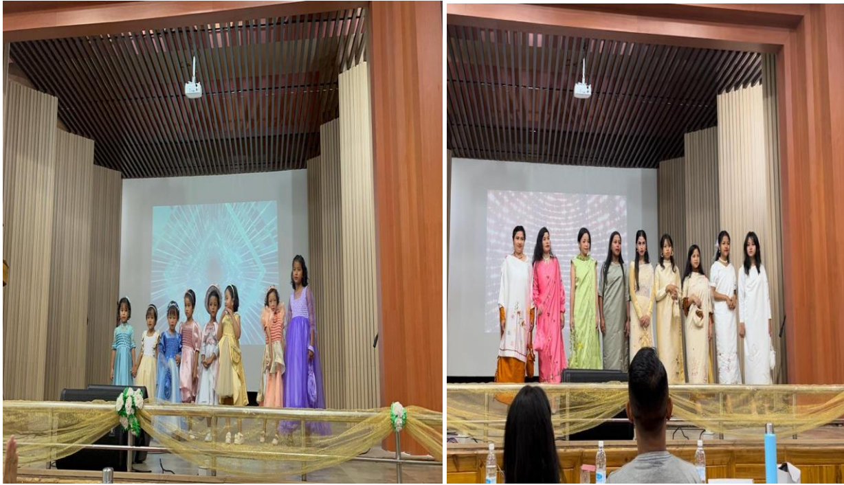
Fashion Show College Week 2023