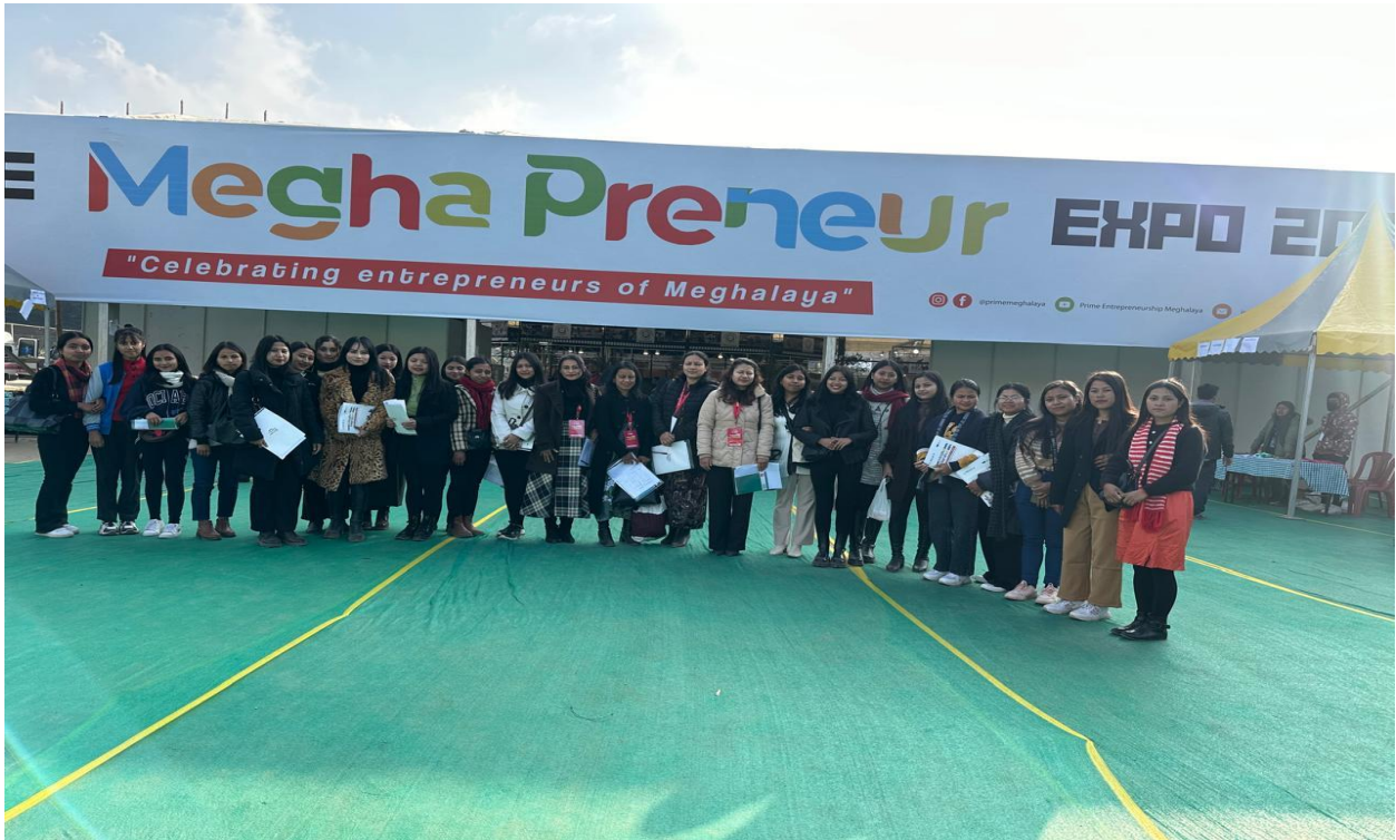
Megha Preneur Expo 2024